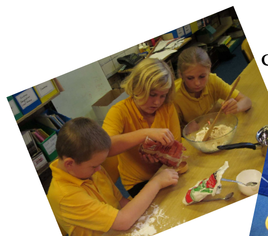
Cooking Anzac Biscuits with 3/6B