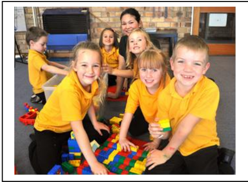
KW demonstrating problem solving skills in structured play.