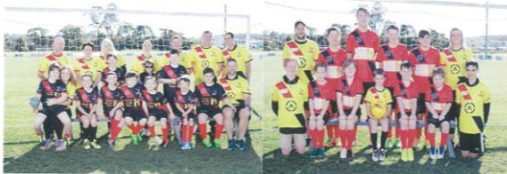
Some of our 2017 Arnett's players, family members, coaches and volunteers.

Then come along to our open days and see what an awesome experience your child & your family will get out of being part of the Edgeworth FC Arnett's!