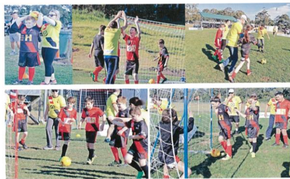
Above – Some of the on field action from our 2017 season game days