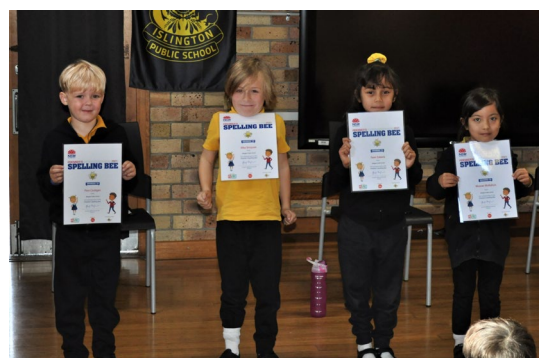
Early Stage 1 Finalists