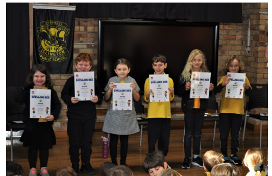
Stage 1 Finalists